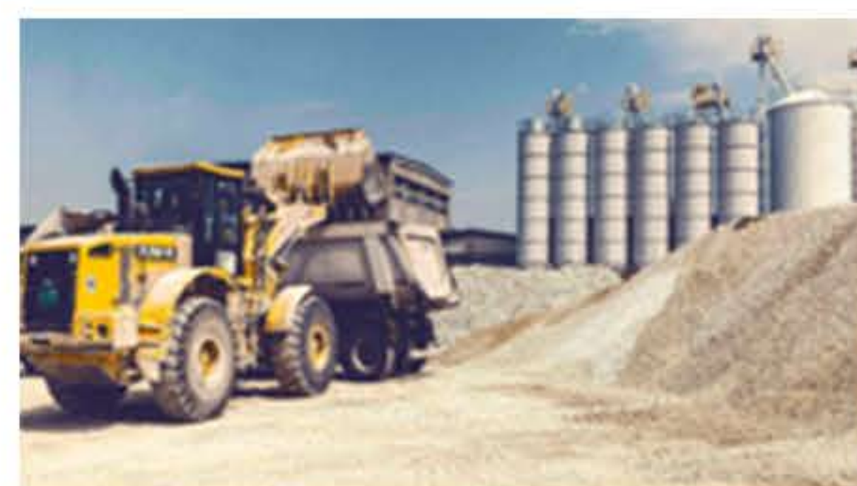
Run Hours Monitoring