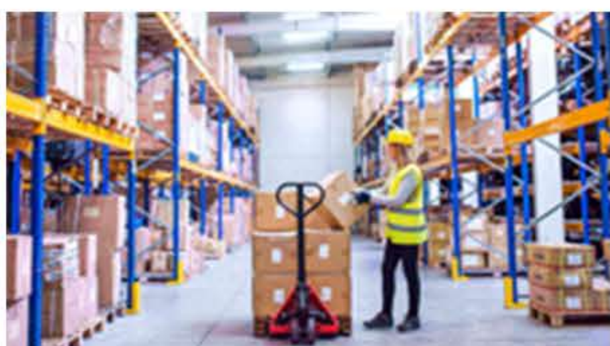
Indoor/Outdoor Asset Tracking